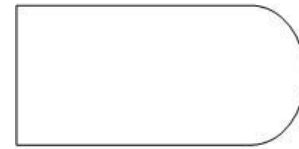
1/8" or 1/4" Radius